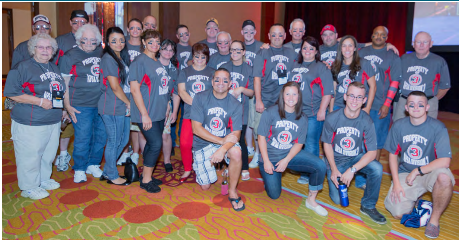
Members of Division 3 enjoying the “Favorite Team” Theme on the Opening Night at the 2016 AFSA International Convention/ Airman’s Conference in San Antonio, TX. Everyone’s favorite team was our own Division 3.