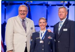
Page 3 & 4 Campaign Results