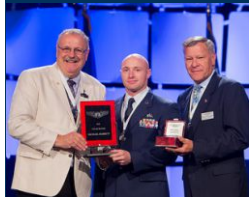
Page 2 Celebrating Excellence