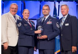
Page 5 & 6 Recruiting & Retention Results