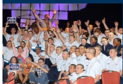
Page 8 JROTC Program and Helpful Hints

The Air Force Sergeants Association publishes the UPDATE to provide you with end-of-year Recruiting and Retention results, and to congratulate those who worked diligently to build their AFSA!