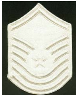
AN E-8 WHITE CEREMONIAL CHEVRON, CIRCA 1960

Our chevrons saw three additional significant changes through the 1950s. The first was the introduction of the diamond to signify the position of first sergeant.