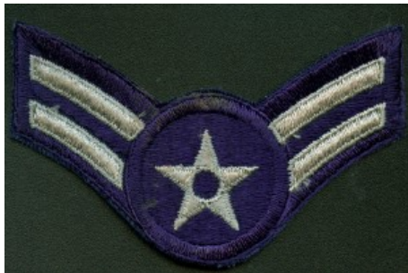
AN ORIGINAL DESIGN E-3 CHEVRON CIRCA 1950

When we became a separate service on 18 September 1947, most people didn't really notice much difference. They put on the same uniform they wore the day before and went to work. At that time Air