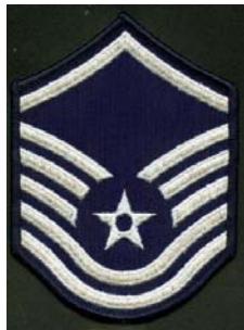
THE CURRENT CHEVRON FOR E-7 MASTER SERGEANT WITH THE ROCKER ON TOP

The 1980s saw very little changes to our chevrons with one exception. Probably one of the most debated changes in Air Force chevron history was the implementation of shoulder boards for senior NCOs. This change seemed to quickly break into two camps, those that loved it, and those that hated it. Regardless, the shoulder board rank only survived about 25 years and were recently phased out by the Air Force Uniform Board.