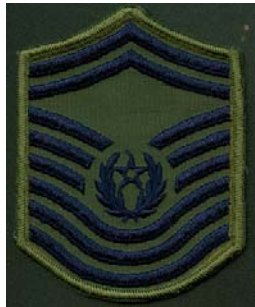
A RARE, SUBDUED, FEMALE CHIEF MASTER SERGEANT OF THE AIR FORCE CHEVRON

At this time our enlisted grades were called Airman Basic, Airman Third Class, Airman Second Class, Airman First Class, Staff Sergeant, Technical Sergeant, and Master Sergeant.