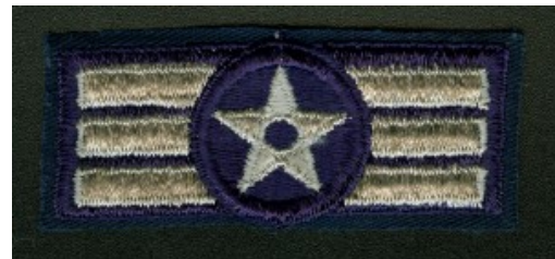
HORIZONTAL RANK APPROVED BY GENERAL VANDENBERG IN 1950 AND LATER DISAPPROVED BY GENERAL TWINNING.

In 1950, General Vandenberg directed that enlisted personnel would now be called Airman vs. Soldier. Finally, in 1952 the Air Force recognized that it needed to build a force structure that met the needs of the Air Force. By restructuring, the Air Force could concentrate on improving leadership training for the top three NCO ranks. It was also determined at this time to redesign the lower three Airman chevrons to signify the difference between the Airman and NCO structures. The new Airman chevrons were redesigned with horizontal wings vs. the familiar upward