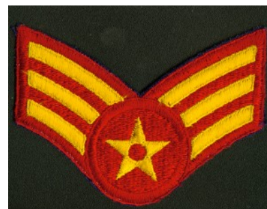
AN E-4 PROTOTYPE CHEVRON. IT IS UNKNOWN WHAT THIS CHEVRON WAS DESIGNED FOR BUT IT IS FROM CIRCA 1950

The Air Force enlisted chevron has seen many changes since it was first adopted in the early 1950s, and will most likely see additional changes throughout the future of the Air Force. What is most important is that all Airmen, regardless of generation always wear them with pride and know that those stripes represent the backbone of the Air Force.