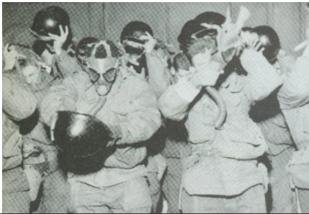
AIRMEN RECEIVE GAS MASK TRAINING WHILE AT BASIC MILITARY TRAINING AT SAMPSON AFB, NY IN THE 1950S

bine. The first day consisted of classroom training on all nomenclature items of the weapon and the qualities of the ammunition used with the M1 Carbine. Airmen also learned how to site and aim the M1, as well as breathing techniques, trigger squeeze and firing positions. On day two Airmen received training in range procedures, dry firing and familiarization firing. Finally on day three, Airmen fired the M1 in live fire on the shooting range and became fully qualified on the weapon.