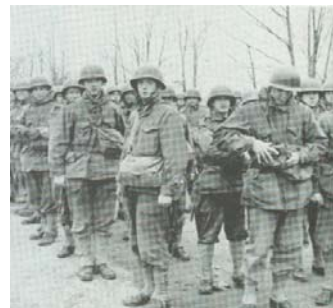
AIRMAN ON FIELD EXERCISES DURING BASIC MILITARY TRAINING AT SAMPSON AFB, NY IN THE 1950S

Today's BMT has recently been restructured to include training for the Expeditionary Airman, this includes a week of field training at the "BEAST" that zeros in on combat field skills required by all Airmen. Although some may think this is a new concept, it is hardly a new idea in the annals of Air Force BMT. During the height of training at Sampson AFB, the United States was fully engaged in the Korean War. During this time period, as many as 25,000 Airman were receiving training at the base to prepare them for "expeditionary" service in Korea.