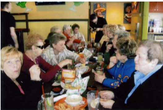
AUXILIARY PRESIDENT'S APPRECIATION LUNCH