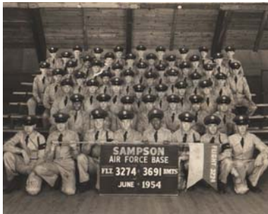
SAMPSON AFB FLIGHT 3274, 3691 BMTS, JUNE 1954

Through the passing of time, many of the historical side notes of Air Force enlisted heritage have slowly faded from memory. Today, most Airmen think that Air Force Basic Military Training has always been accomplished at Lackland AFB, Texas. Although the majority of Airmen that have served in the Air Force walked through the gates at Lackland, it is not the only base that was used to transition civilians to blue suiters. In all the Air Force has utilized five large scale BMT bases over the years, Lackland AFB, TX; Parks AFB, CA; Sheppard AFB, TX; Amarillo AFB, TX; and Sampson AFB, NY.