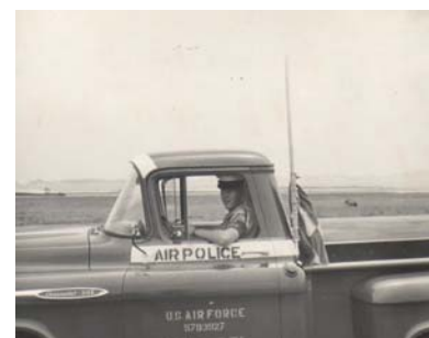
AN UNIDENTIFIED AIR POLICE MEMBER ASSIGNED TO KINDLEY AFB, BERMUDA IN THE 1950s

THE PROFESSIONAL ORGANIZATION OF CHOICE FOR AIR FORCE ENLISTED