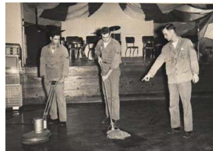
"YOU MISSED A SPOT" ...I'M SURE ALL OF US THAT HAVE WORN THE UNIFORM HAVE BEEN IN THIS SITUATION AT ONE TIME OR ANOTHER.