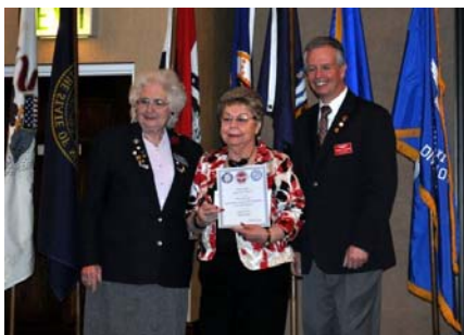
DIVISION 89 AUXILIARY CHAPTER OF THE YEAR > 125 CHAPTER A804, KANSAS CITY