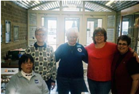
CHAPTER A851 MEMBERS THAT PARTICIPATED IN THE FUND RAISER TO HELP ENLISTED MEMBERS OVERSEAS