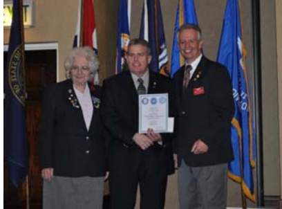
DIVISION 89 CHAPTER OF THE YEAR > 500 CHAPTER 872, SCOTT AFB