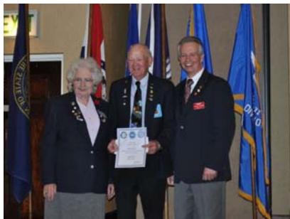
DIVISION 89 CHAPTER OF THE YEAR < 500 CHAPTER 988, ALTUS AFB