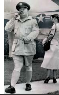
A MSGT SPORTS A FINE LOOKING PAIR OF SHORTS AS A WAF LOOKS ON IN "SHOCK". ON A PERSONAL NOTE, I'M VERY GLAD THE AIR FORCE GOT RID OF THIS UNIFORM