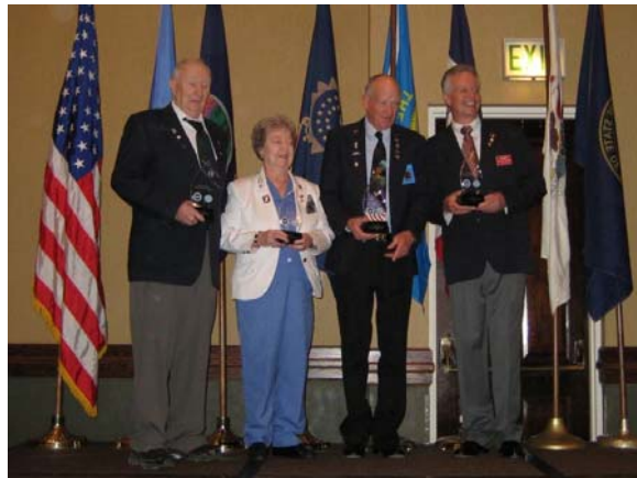
LIFETIME RECRUITER ACHIEVEMENT AWARD RECIPIANTS