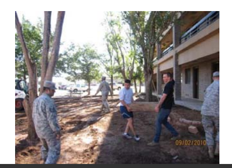
CHAPTER 988 MEMBERS CLEAN UP THE EXTERIOR OF DORMITORY 331 ON ALTUS AFB.

After surveying the grounds Chapter 988 took steps to research the possibility of sponsoring a self-help project to improve the surrounding landscaping, and address other quality-of-life concerns that the residents had.