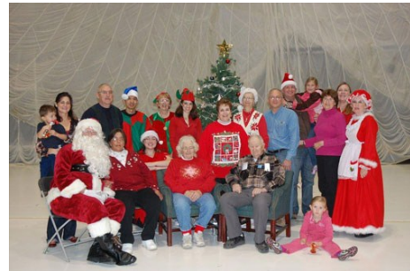
MEMBERS OF CHAPTER 851 AND A851 AND THEIR FAMILY MEMBERS IN THEIR LAST OFFICIAL FUNCTION AS A CHAPTER AND AUXILIARY