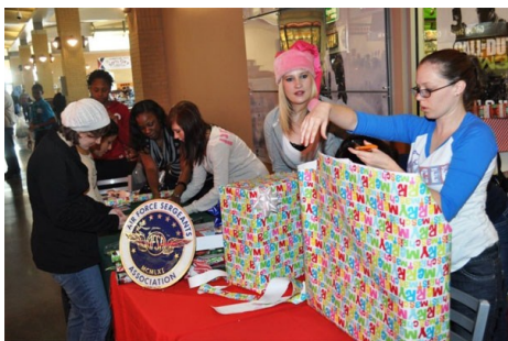
CHAPTER 985 MEMBERS WRAP PRESENTS DURING THEIR GIFT WRAPPING FUNDRAISER

Most AFSA Chapter's have an annual fundraiser that is vital to their membership outreach and appreciation events for the upcoming year. This year was no different for Chapter 985. The gift-wrapping fundraiser held at the Tinker Exchange was a huge success with a record number of proceeds raised to date. It kicked off on Black Friday and ended on Christmas Eve with 270 volunteers working 1,410 hours. The key to the success for this year's event was teamwork. We had several squadrons, leaders and First Sergeants come out and donate their time.