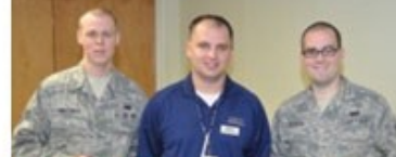
CHAPTER 985 MEMBERS RECEIVE EDUCATIONAL GRANTS. SPECIAL THANKS FOR THE TINKER FEDERAL CREDIT UNION FOR THEIR MONETARY ASSISTANCE.