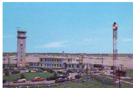
BASE OPERATIONS, LINCOLN AFB, NEBRASKA