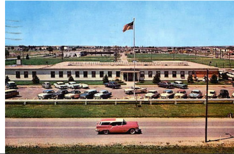
818TH AIR DIVISION HEADQUARTERS, LINCOLN AFB, NEBRASKA

In 1960, the base saw further growth with the addition of the 551 st Strategic Missile Squadron and