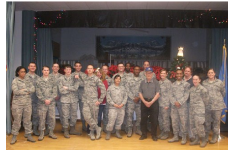
MEMBERS OF AFSA CHAPTER 951 WENT TO THE SOUTH DAKOTA VETERANS HOME IN HOT SPRINGS, SD ON 2 DEC 2011 TO HELP PUT UP CHRISTMAS DECORATIONS FOR THE RESIDENTS AND SING CAROLS.