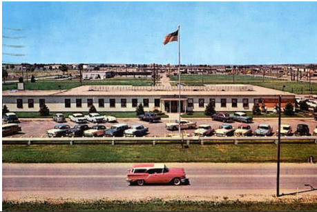
818TH AIR DIVISION HEADQUARTERS, LINCOLN AFB, NEBRASKA