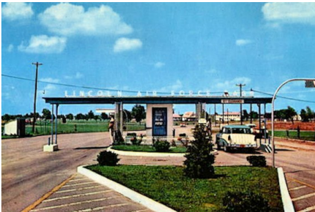
LINCOLN AFB FRONT GATE

Over the years, I have collected hundreds of pieces of Air Force memorabilia, much to the consternation of my wife. One piece that I acquired several years ago was a miniature postcard booklet for Lincoln AFB, Nebraska. Until that point I hadn't heard of Lincoln AFB even though I grew up in Nebraska. I remember driving by the Air National Guard base when I would drive home from F.E. Warren AFB but never really gave much thought to there ever being an active duty Air Force Base in Lincoln.