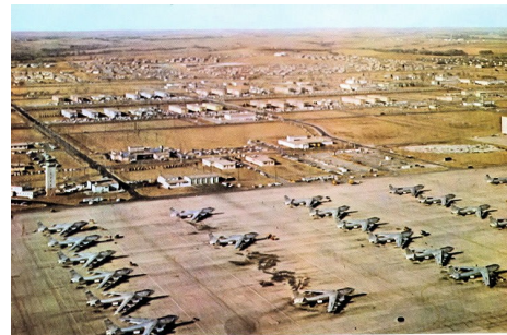
B-47 STRATOJETS ON THE FLIGHTLINE AT LINCOLN AFB, NEBRASKA

12 Atlas Intercontinental Ballistic Missiles. Once the missiles became operational in 1962, along with a US Army Nike missile sites, things were looking very good for the longevity of Lincoln, but the base's quick rise was rivaled by its equally quick descent.