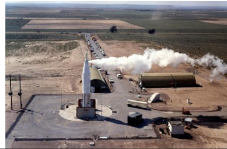
A TYPICAL ATLAS F MISSILE SITE

The end started in 1965 with the deactivation of the 307 th and the 818 th and was quickly followed by the removal of the Atlas ICBMs and deactivation of the 551 st . Eleven years after the first B-47 arrived in Lincoln, the last aircraft departed the base and by mid-1966 this once major AFB became a footnote in history.