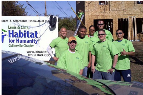
MEMBERS OF CHAPTER 872 WORKING AT THE COLE STREET HOUSE IN COLLINSVILLE, IL