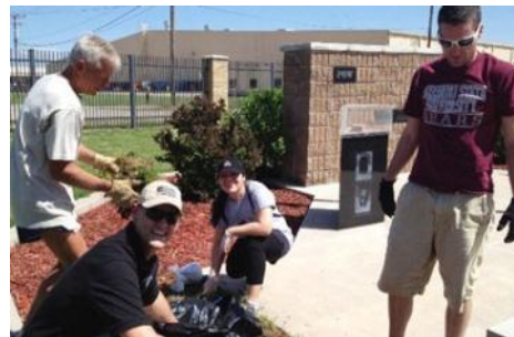
VOLUNTEERS WITH THE AIRMAN'S ACTIVITIES PROGRAM FOR CHAPTER 985 CLEAN UP THE TINKER AFB AIR PARK. THE CHAPTER VOLUNTEERS THEIR TIME EACH MONTH TO KEEP THE PARK IN PRISTINE CONDITION.

Airman Activities Program coordinated 7 volunteers donating an hour each for Operation Tinker air park cleanup. Cleaning up the air park improved the Quality of Life for over 20K military and civilian employees who live/work at Tinker Air Force Base. Chapter 985 performs this clean up the last Friday of every month.