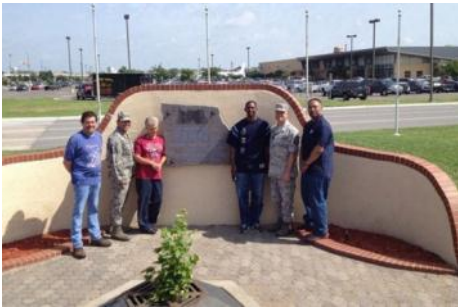
CHAPTER 985 TEAMED UP WITH THE BASE TOP 3 TO SPONSOR THIS YEAR'S MEMORIAL FOR THE PEOPLE KILLED IN THE 1995 OKLAHOMA CITY BOMBINGS.

were victims of the April 19, 1995 bombing in Oklahoma City. Two wreaths were placed at the memorial site to honor both Airman.