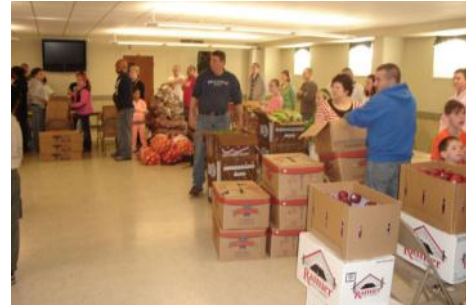
CHAPTER 872 MEMBERS HELP PACK FOOD BOXES FOR CARING HEARTS. IN ALL, THE CHAPTER HELPED PACK 2,200 BOXES IN 2011.

boxes with about 20 of those going back to the Scott AFB community. During the Holidays, in November and December, it is not uncommon for volunteers to put together up to 300 boxes per month. In 2011, Chapter 872 helped to assemble over 2,200 boxes.