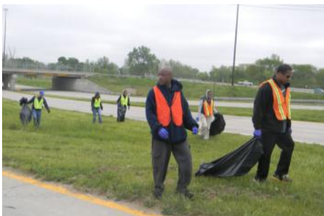
CHAPTER 984 WORKING THEIR ADOPT A ROAD IN SARPY COUNTY

Eventually, the storm clouds lifted and everyone emerged from their hiding places. It was time once again to re-look our commitment to Bellevue and to get our section of Fort Crook Road beautified. The new date of 28 April was selected and we pressed forward. Once again all the coordinations were made, but this time we added our own little silent prayers for better weather. The day prior we receive news of 40% rain showers. I sent out another e-mail, but this time it was, "Rain or shine we go!" When we arose from our beds on that Saturday morning, we heard the birds singing and saw little rays of sunshine peaking through the clouds. We had a tiny window of opportunity before it started to get wet! Our 21 person AFSA Army proceeded down the 1-mile stretch of asphalt obliterating litter as we came upon it. In the end, all that remained were filled garbage bags. We walked back to our starting point with our heads held high as we reflected on a job well done! Now the score was tied and we had bested Mother Nature. We'll hold these bragging