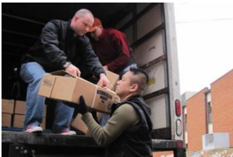
CHAPTER 872 MEMBERS HELP UNLOAD A TRUCK DURING A CARING HEARTS EVENT.

Caring Hearts is a local food drive charity which AFSA Chapter 872 supports. It is under the direction of the First United Methodist Church in O'Fallon. Our chapter assists in assembling and filling the food boxes which many churches in the surrounding community utilize in order to purchase essential sustenance for their underprivileged members and elderly homebound. Additionally, the First Sergeants Group purchases a number of boxes to provide assistance to Airmen and their families in need.