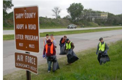
CHAPTER 984 WORKING THEIR ADOPT A ROAD IN SARPY COUNTY

It was Friday the 13 April 2012, the morning before our Spring Adopt-A-Highway event. All the coordinations had been accomplished; we had 60 volunteers ready to go along with the garbage bags and re-