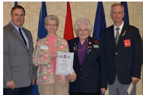
CHAPTER A851 ACCEPTS THE AUXILIARY COMMUNITY SERVICE AWARD FOR 2012