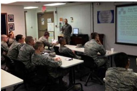
CHAPTER 985 SIGNED UP 95% OF FTAC ATTENDEES DURING THEIR APRIL 24TH BRIEFING. THESE AIRMEN ARE KEY TO THE FUTURE OF OUR ORGANIZATION.