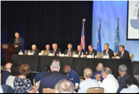
FORMER CMSAF PANEL AT THE AFSA PAC