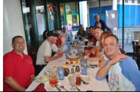
DIVISION 89 ENJOYS A NIGHT ON THE TOWN TOGETHER DURING THE 2012 AFSA PAC

Absolutely superior results from the Division 89 team. Once again, thank you for everything you do.