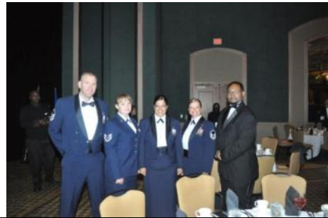
DIVISION 89 MEMBERS SQUARED AWAY FOR THE AFSA PAC HONORS BANQUET