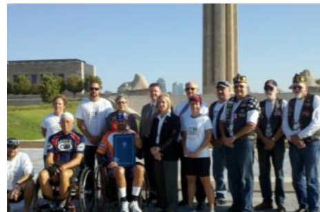
VETERANS FROM THE KANSAS CITY AREA MEET WITH MEMBERS OF THE LONG ROAD HOME PROJECT AS THEY CYCLED THROUGH KCMO.

The Long Road Home Project is a group of five disabled veterans who are riding their bicycles and hand cycles across America to bring awareness to the challenges faced by returning veterans of America's wars both past and present.