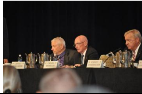
FORMER CMSAF MCCOY TELLING IT STRAIGHT AT THE CMSAF PANEL DURING THE 2012 AFSA PAC