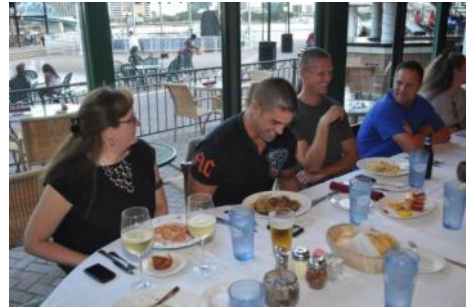
DIVISION 89 MEMBERS ENJOYING A NIGHT OUT ON THE TOWN