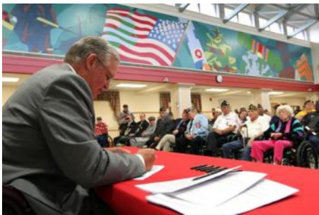
GOVERNOR NIXON SIGNS HB 1731 IN FRONT OF WAR VETERANS AND MAVO MEMBERS AT A MISSOURI VETERANS HOME.

AFSA Chapter 804 is a member of the Missouri Association of Veterans Organizations (MAVO) who organized these rallies and is very active in working with elected officials in the state legislature to address concerns of the veteran community in Mis-