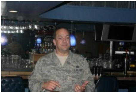
CHAPTER MEMBER AND 97TH AMW COMMAND CHIEF BRIEFS CHAPTER 988 MEMBERS ON AIR FORCE ISSUES DURING THE LAST CHAPTER MEETING.

On Altus we assist with the Deployed Dinner for Spouses, the ASYMCA luncheons, Warrior Welcome, FTAC, NCOPE, ALS and the annual awards banquet.