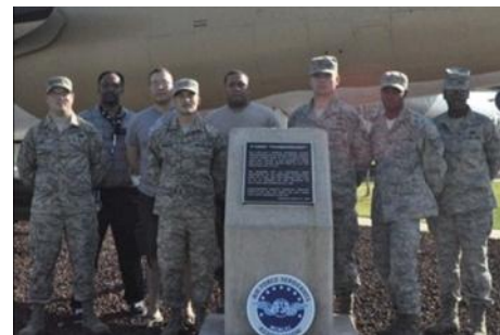
CHAPTER 985 MEMBERS CONTINUE THEIR OUTSTANDING SUPPORT FOR THE TINKER AFB, CHARLES B. HALL AIR PARK.

August 31, 2012: 15 Volunteers cleaned/picked weeds for 45 minutes for Tinker Charles B. Hall Air Park Beautification Project.