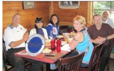
CHAPTER 985 MEMBERS CONDUCTING A MEETING OFFBASE TO SUPPORT MEMBERS WHO ARE UNABLE TO ATTEND NORMAL MONTHLY MEETINGS.

June 21, 2012: Conducted a Quarterly General Membership Meeting at the Santa Fe Cattle Co. at 5:00PM. The purpose of a quarterly general membership (GM) meeting is to attract members that are unable to attend our monthly meetings, yet want to engage in/meet other members for possible future involvement. The meeting lasted about an hour and had 12 attendees.