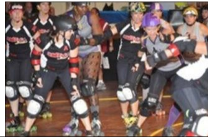
THE OKLAHOMA CITY GIRLS ROLLER DERBY LEAGUE WAS THE LATEST OUTING FOR CHAPTER 985 MEMBER APPRECIATION.