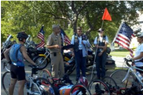
VETERANS FROM THE KANSAS CITY AREA MEET WITH MEMBERS OF THE LONG ROAD HOME PROJECT AS THEY CYCLED THROUGH KCMO.

Road Home Project participants to several events in Kansas City to include a tour of the Liberty Memorial WWI Museum; a Proclamation Ceremony where they received a proclamation from Mayor Sly