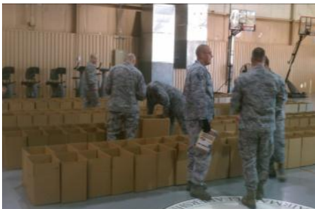
CHAPTER 984 MEMBERS SORT FOOD DURING THEIR ANNUAL THANKSGIVING FOOD DRIVE.

The Monday before Thanksgiving more people are