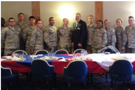
CHAPTER 985 SIGNED UP 95% OF FTAC ATTENDEES DURING THEIR APRIL 24TH BRIEFING. THESE AIRMEN ARE KEY TO THE FUTURE OF OUR ORGANIZATION.