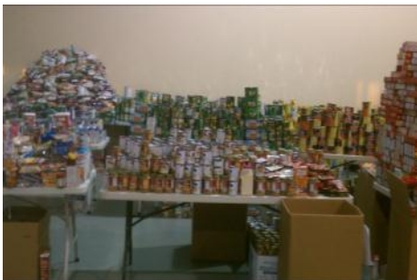
CHAPTER 984 COLLECTED LARGE QUANTITIES OF FOOD STORES FOR ITS ANNUAL THANKSGIVING FOOD DRIVE.

During a two-week period over 200 volunteers give 275 man-hours to come together as a team to make this day of giving happen. It first starts by soliciting donations at the commissary for hours at a time every day for two weeks straight.