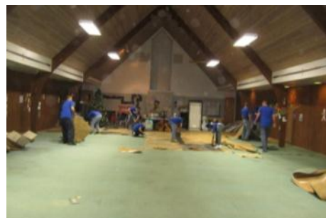
CHAPTER 872 CONTINUED ITS SUPPORT OF THE MISSION CONTINUES BY RIPPING UP AND REMOVED CARPET AND PAINTING CLASSROOMS FOR THE COMMUNITY LINK ORGANIZATION.