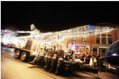
ELLSWORTH AFB SHOWS IT'S PRIDE AND SUPPORT OF THE COMMUNITY BY ENTERING IT'S "B1 Bomber" FLOAT, SPONSORED BY AFSA CHAPTER 951.

The idea started 15 years ago with organizers hoping just 10 businesses would make floats and help create a holiday parade. Sixty-seven businesses signed up and now the event has grown to become a staple of the holiday season.